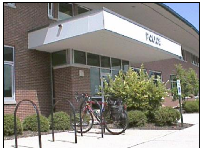
Inverted "U" bicycle racks at Vandalia Justice Center.