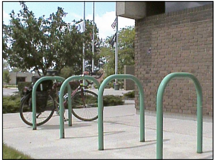
New bicycle racks at Vandalia City Hall